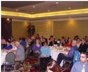
A partial room shot of the 2010 Annual General Meeting