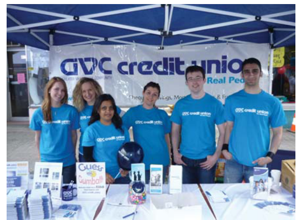
GVC staff in attendance at the festival most of whom are from our Royal Square branch

Thanks to our volunteer staff who helped make it a success.