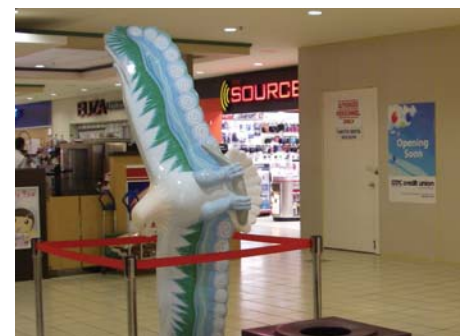
The centre of the lower level of the mall showing our location (store #115) next to The Source.