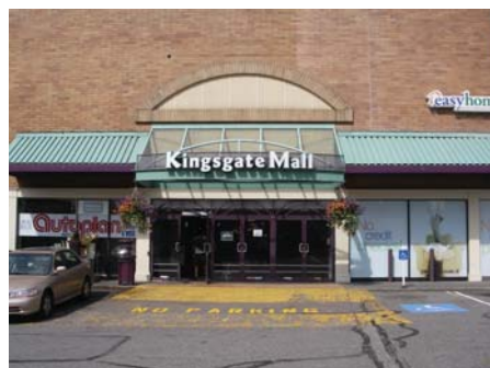
East entrance to the mall accessed from Broadway parking lot and offering the shortest walk to our office.

All members that transfer their account to the new office by September 30th will receive a $100 coupon to spend at one of the Mall's stores.